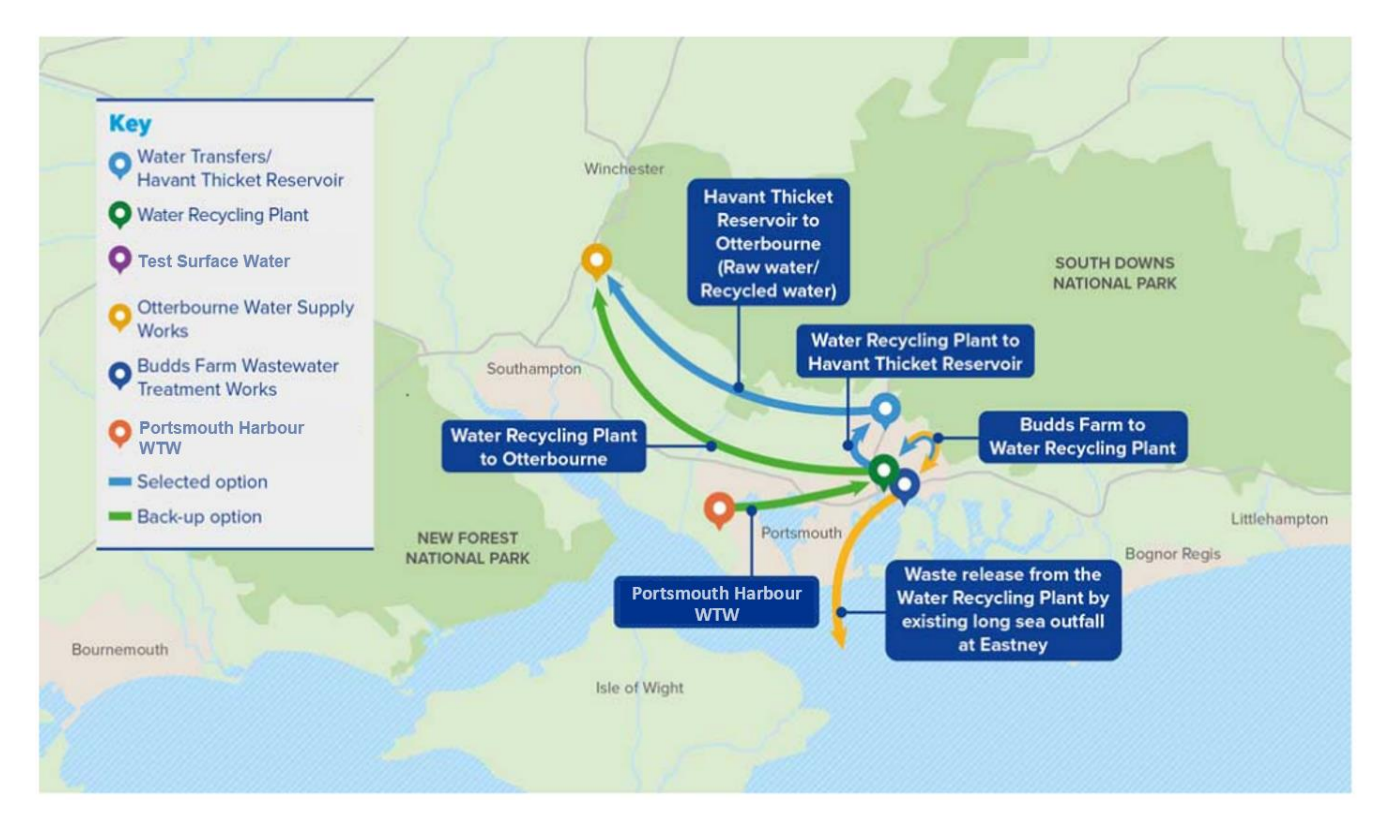
Figure 1: Hampshire Water Transfer and Water Recycling Project

We are expecting to submit our application for development consent to the Planning Inspectorate in Summer 2025.